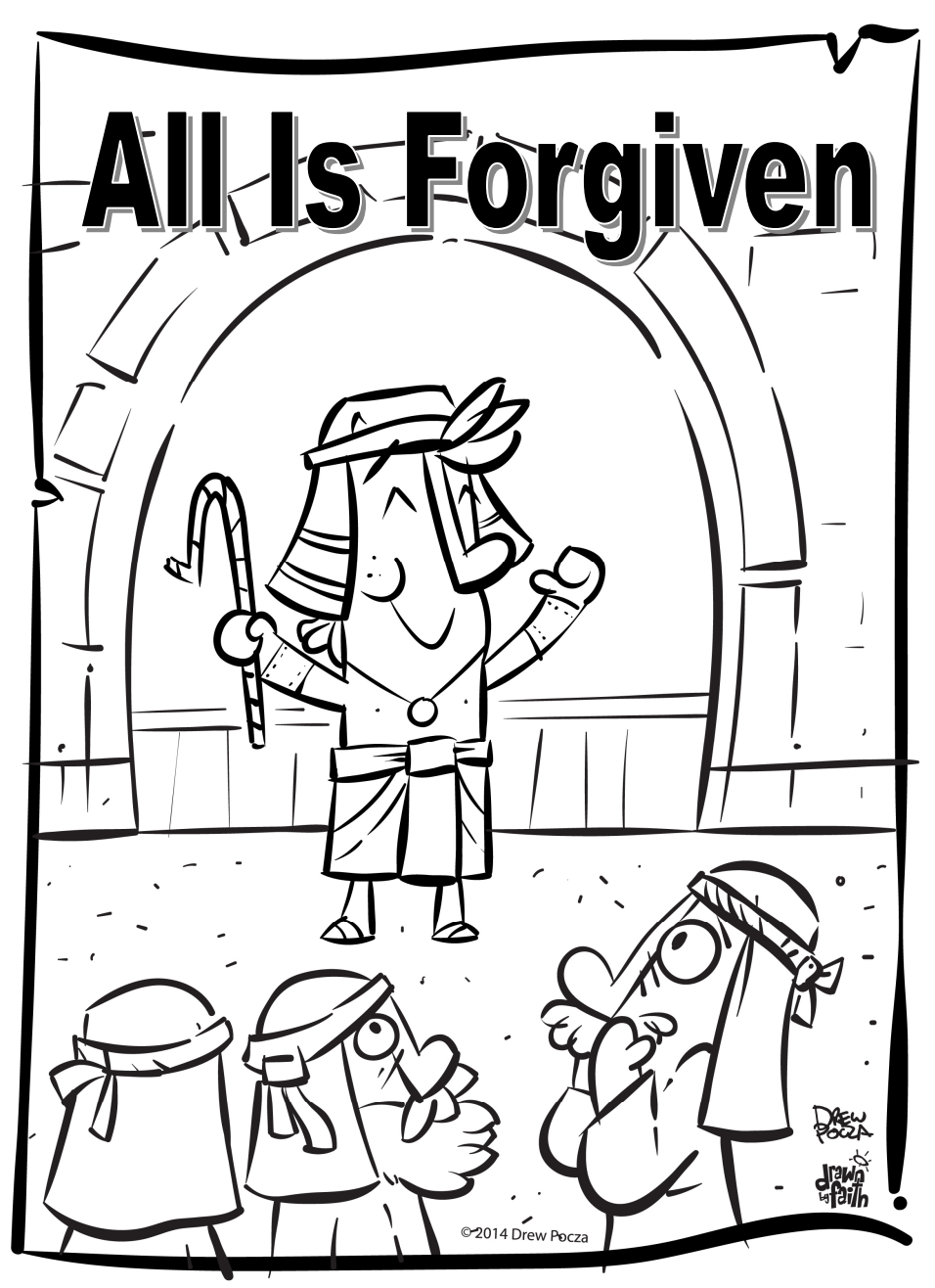
Genesis 42 - 45