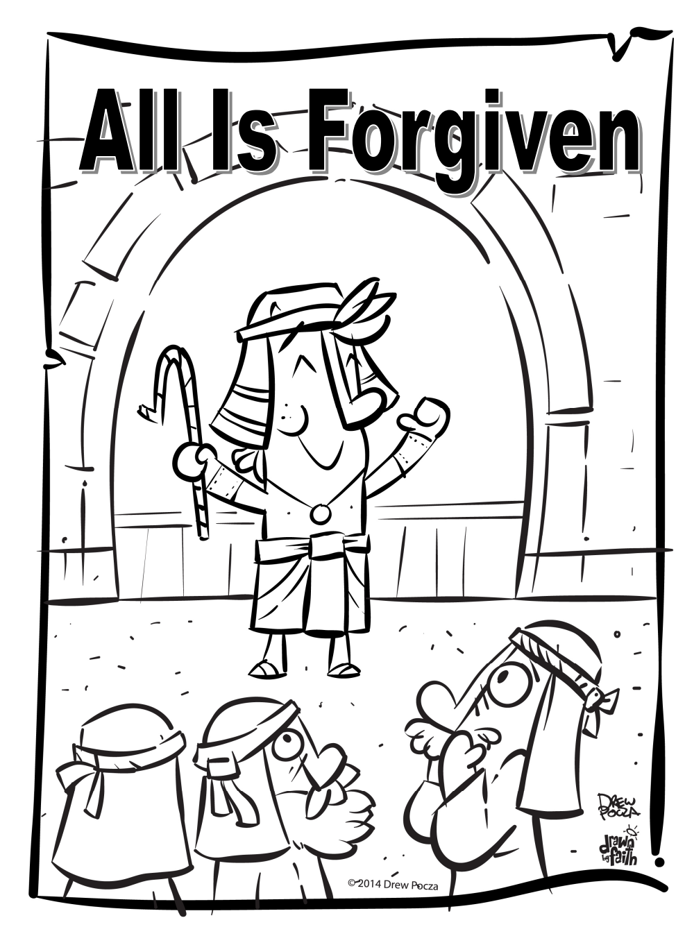
Genesis 42 - 45